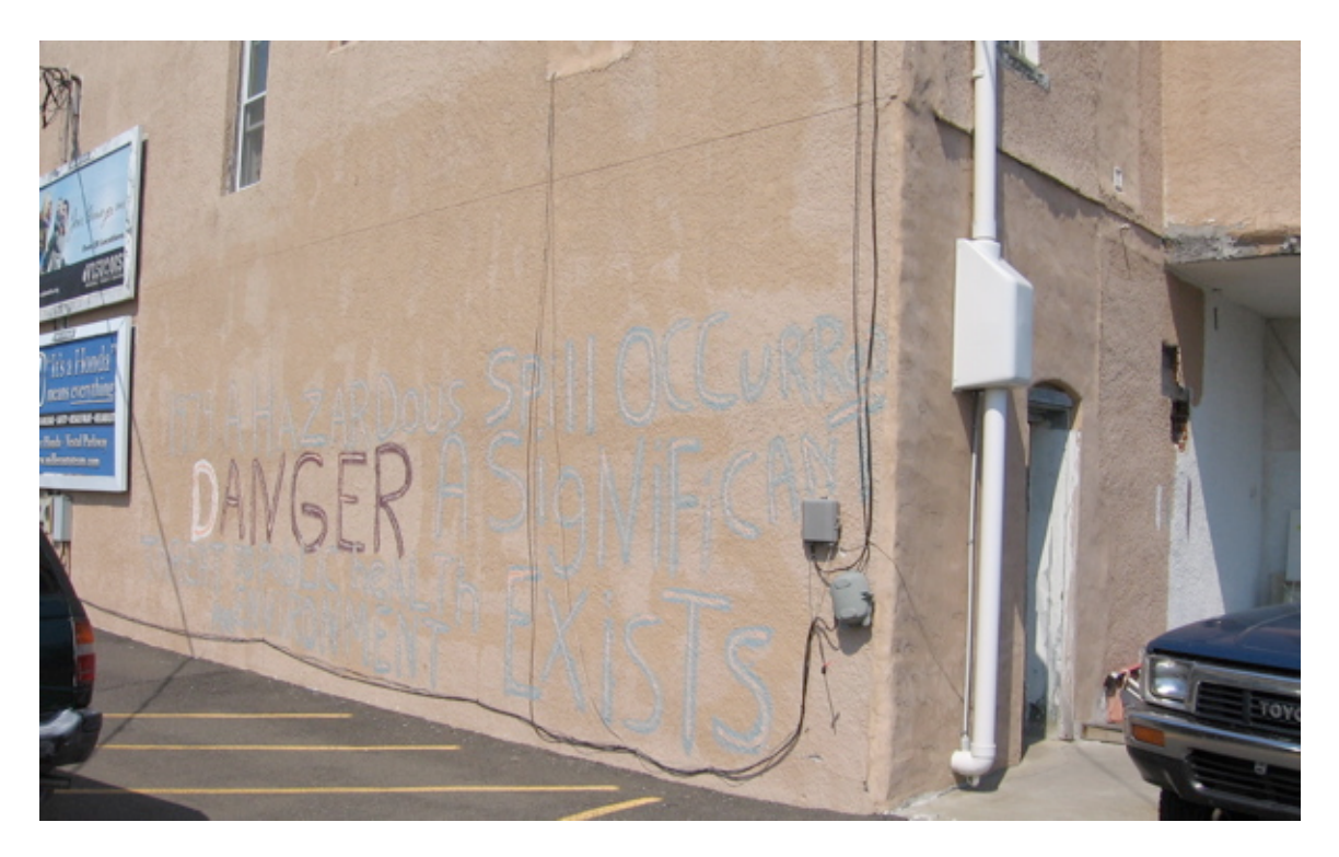
Handwriting on the wall, across the street from IBM old Endicott, NY plant The roof has a large arrow pointing at "IBM's Toxic Plume"

Like homeowners anywhere vapor intrusion is reported, residents were concerned about property sales and values as well as the health effects of vapor intrusion. We shared some anecdotes, but it appears there have been no systematic surveys of the economic impact of the discovery or mitigation of vapor intrusion.