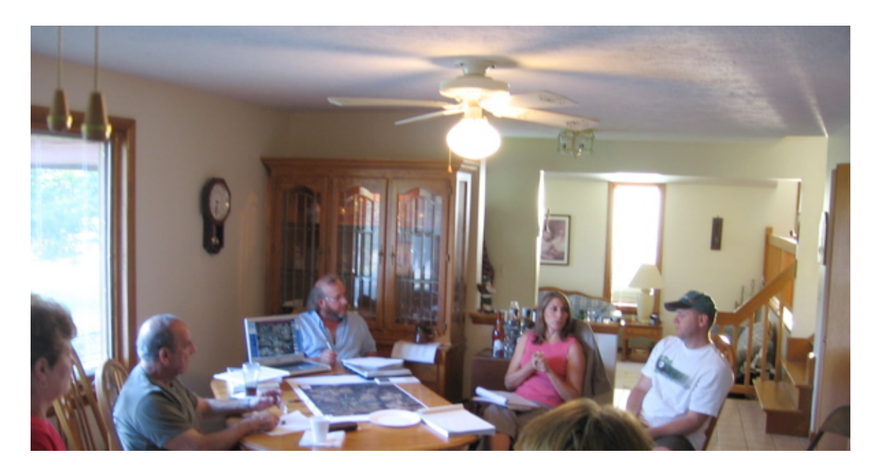
Meeting in a Victor, NY living room