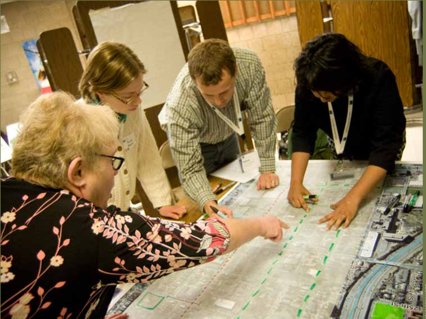
COMMUNITY MEMBERS PARTICIPATE IN A DESIGN CHARRETTE AT THE 2009 NATIONAL PLANNING CONFERENCE IN MINNEAPOLIS