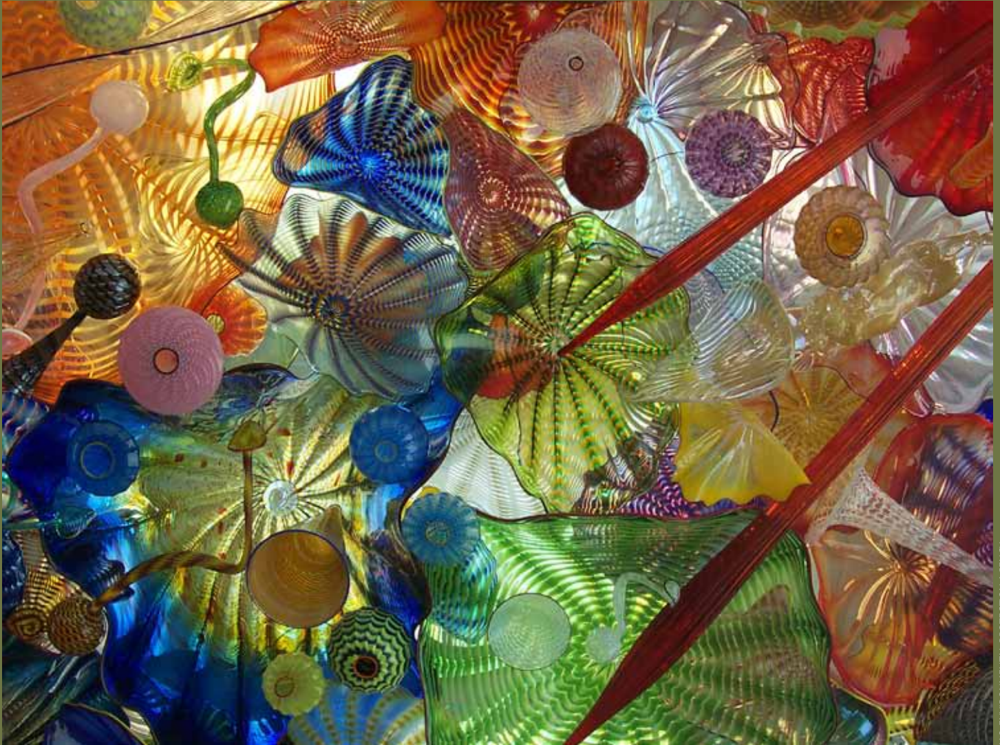
DISPLAY AT THE INTERNATIONAL GLASS MUSEUM IN TACOMA, WASHINGTON. THE MUSEUM WAS BUILT ON THE SITE OF AN ABANDONED COASTAL PORT.