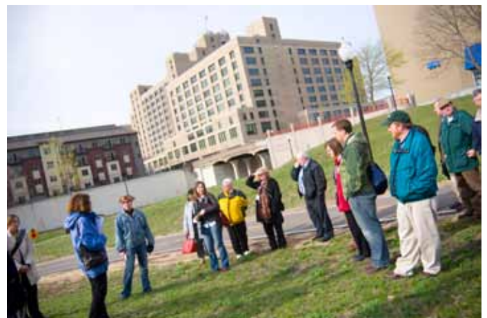
SITE TOUR OF THE COMMUNITY AS PART OF A CHARRETTE AT THE 2009 NATIONAL PLANNING CONFERENCE IN MINNEAPOLIS