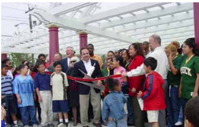
GRAND OPENING OF A REMEDIATED BROWNFIELD IN BRIDGEPORT, CONNECTICUT