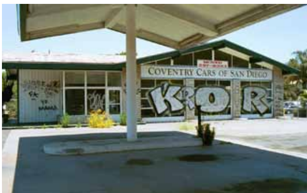
VANDALIZED GAS STATION IN SAN DIEGO, CALIFORNIA

The final step of the cleanup process is often the most satisfying. Once the regulatory agency approves the cleanup job, the agency will issue a no further action (NFA) or a certificate of completion letter. This document is valuable because it serves as proof to potential lenders, developers, and others that the developer remediated the site to the satisfaction of the regulator. CBOs should contact their state or local brownfield program to learn which agency has jurisdiction to regulate brownfields.