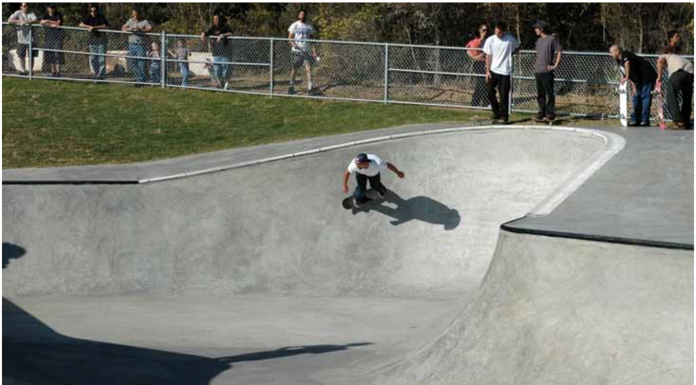
MABEL DAVIS SKATE PARK BUILT ON A CLOSED LANDFILL IN AUSTIN, TEXAS