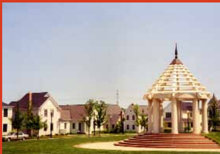
MILL CREEK DEVELOPMENT