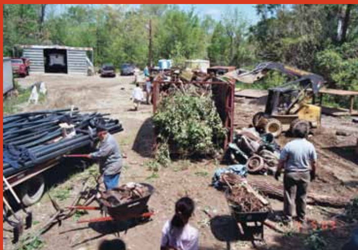
JUNK YARD CLEANUP ON SITE OF CLOSED CLEVELAND STATE HOSPITAL

M ill Creek is a large housing development that provides diverse housing types for a mix of incomes and races. This development, the largest housing project built in Cleveland in the last 50 years, occurred as a result of the tenacity of the nonprofit community development corporation Slavic Village Development (SVD), formerly known as the Broadway Area Housing Corporation. Until the Mill Creek development project in 1990, SVD's primary focus was to rehabilitate low-income rental housing. When the opportunity arose to create new housing while preserving open space in the Slavic Village neighborhood, SVD jumped at the opportunity. At that time, the only open space in Slavic Village was on the grounds of the former Cleveland State Hospital, a state-run psychiatric facility that closed in the 1970s. Though residents knew about the space, they did not have access to it. It was fenced off, contaminated, and littered with trash.