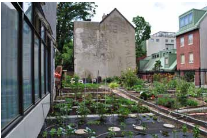
VEGETABLES GROWING WHERE A DILAPIDATED ROW HOUSE ONCE STOOD, PHILADELPHIA