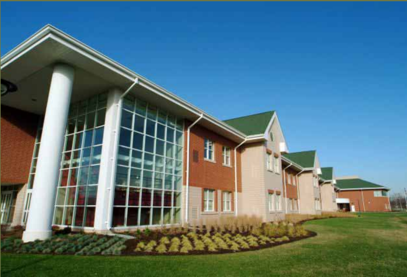
MCCULLOUGH-UNIS SCHOOL ON SITE OF ABANDONED SHARON STEELE PROPERTY IN DEARBORN, MICHIGAN