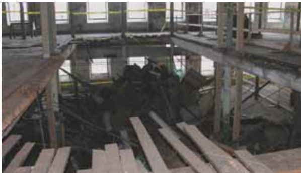
U.S. ENVIRONMENTAL PROTECTION AGENCY