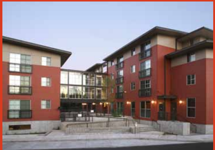
THE WATERSHED IS A MIXED USE AFFORDABLE HOUSING DEVELOPMENT FOR SENIORS

A casual onlooker would have no idea that The Watershed at Hillsdale was once a derelict brownfield. In fact, the new 45,446-square-foot mixed use affordable housing project for seniors has no resemblance to any of its former uses. What was initially developed as a portion of a dairy farm in the 1850s was transformed over the next 150 years into a neighborhood train station, an auto wrecking and gas station facility, storage space for The Oregonian newspaper, and a sanitation vehicle parking lot. Throughout its history, the property, which sits at the confluence of three high-volume streets in the heart of the Hillsdale neighborhood of Portland, Oregon, experienced long periods of abandonment.