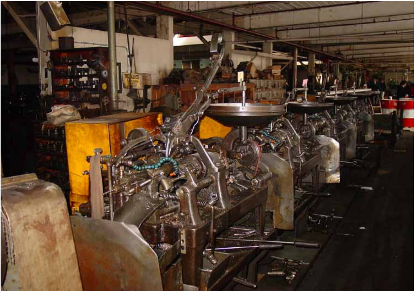
THE ABANDONED WHITNEY SCREW COMPANY COMPLEX IS NOW HOME TO GOODALE'S BIKES, NASHUA, NEW HAMPSHIRE