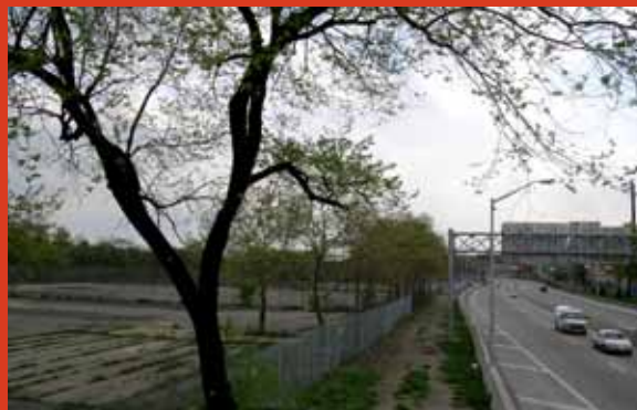
NEGLECTED COURTS AND INDUSTRIAL CONTAMINATION MAKE STARLIGHT PARK AN UNDESIRABLE NEIGHBORHOOD PARK. CLEANUP AND REDEVELOPMENT IS CURRENTLY UNDERWAY.