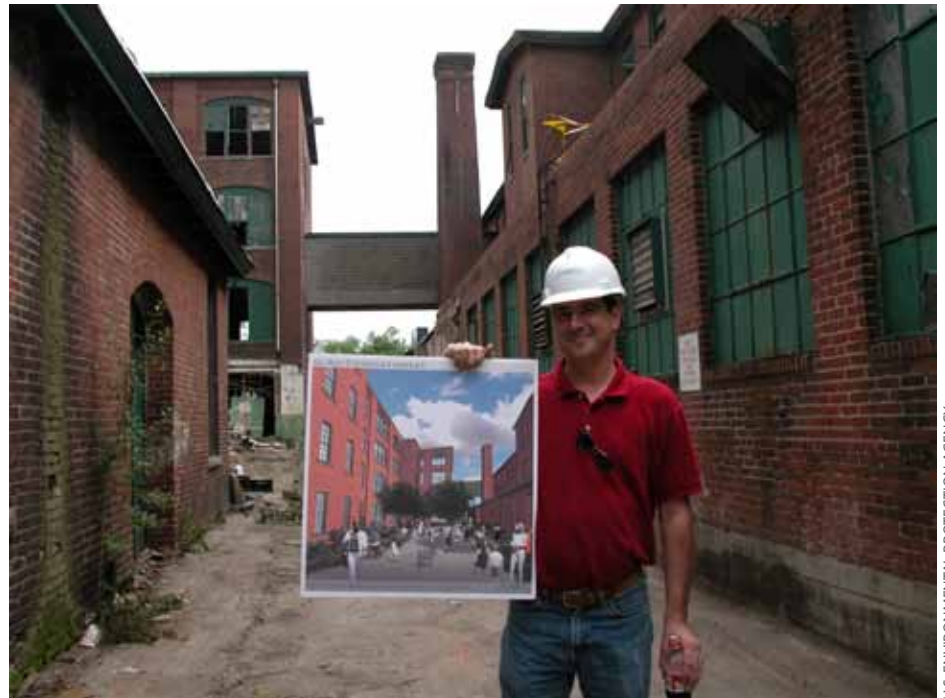
RAU FASTNER MILL COMPLEX WAS REDEVELOPED INTO AFFORDABLE LOFT APARTMENTS IN PROVIDENCE, RHODE ISLAND