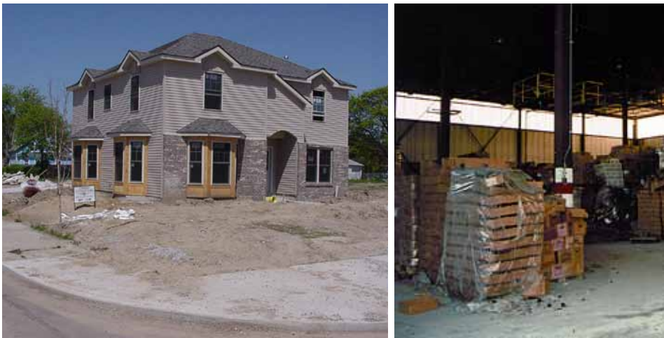
U.S. ENVIRONMENTAL PROTECTION AGENCY

Despite these negative impacts, brownfields present an opportunity to communities. Redevelopment efforts across the country have transformed former gas stations, contaminated industrial sites, dilapidated hospitals, and run-down, asbestos-laden schools into affordable housing, parkland and open space, community centers, housing for elderly, mixed-use developments, and even community gardens and other forms of urban agriculture (see page 33 for more information on agriculture-related uses on remediated brownfields). Brownfields are often found in prime locations—central to business districts, bordering or within neighborhoods, along popular commercial corridors, and on high-traffic transportation routes, and provide opportunities for economic development in historically disinvested communities. Brownfields offer developable land in otherwise built-out communities. The redevelopment of even a single brownfield site can spur economic development and opportunities throughout an entire district.