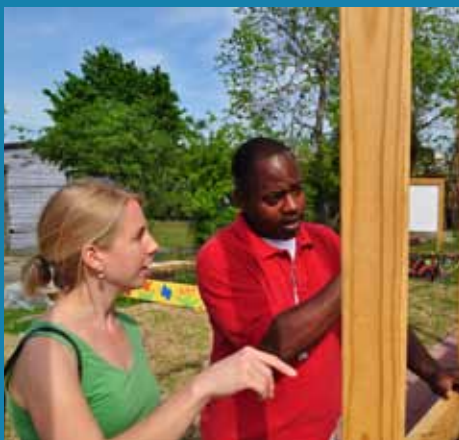
URBAN AGRICULTURE IN NEW ORLEANS

There are two broad remediation technology categories: physical and biological. Physical remediation techniques seek to remove, cap, wash, or extract contaminants from soil. Biological techniques include phytoremediation, fungal remediation, compost remediation, and microbial remediation. Remediation technologies are discussed in greater detail in Urban Agriculture and Soil Contamination: An Introduction to Urban Gardening (available at http://cepm.louisville.edu/Pubs_WPapers/practiceguides/PG25.pdf ).