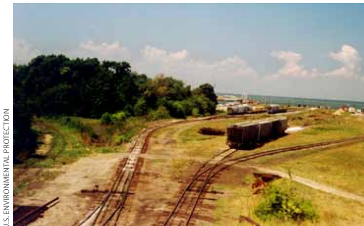
RAIL YARD AND DUMP SITE WAS CLEANED AND REDEVELOPED INTO A

Different cleanup options will, of course, affect costs. For example, a cleanup that relies on placing a clay cap on contaminated soil is likely to be much less expensive than one that involves hauling the contamination away to a landfill. This is particularly true when a CBO does not factor in the longer term costs of monitoring the clay cap, making sure it remains intact and protective by removing potential exposures to waste in place. The longer term costs of engineering controls (i.e. physical barriers) and institutional controls (i.e. land use restrictions, deed notices) need to be factored into this decision-making process and included in community decisionmaking. But costs, while important, may be only one factor among many in evaluating cleanup options.