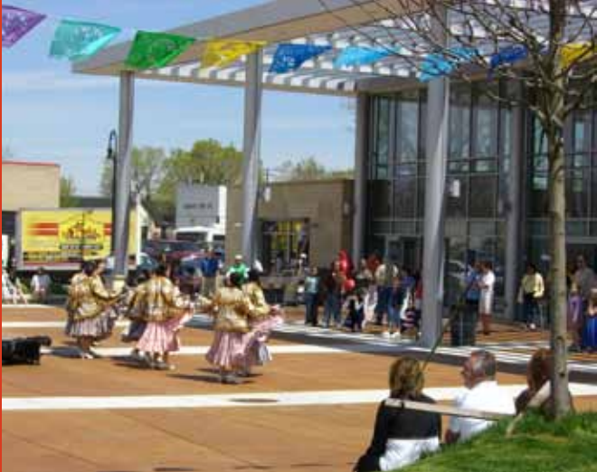
GRAND OPENING CELEBRATION OF THE INTERNATIONAL WELCOME CENTER