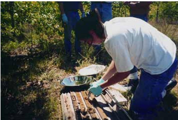
U.S. ENVIRONMENTAL PROTECTION AGENCY

After all the information is gathered and analyzed—typically a process that takes two to three weeks—the consultant provides a summary of findings to the developer. This report will include details of any on-site and off-site environmental concerns, identify potential environmental liabilities, and offer recommendations for next steps.