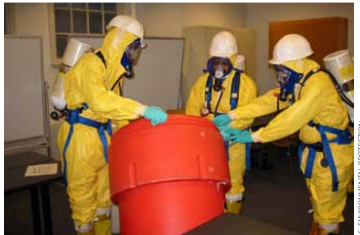
U.S. ENVIRONMENTAL PROTECTION AGENCY