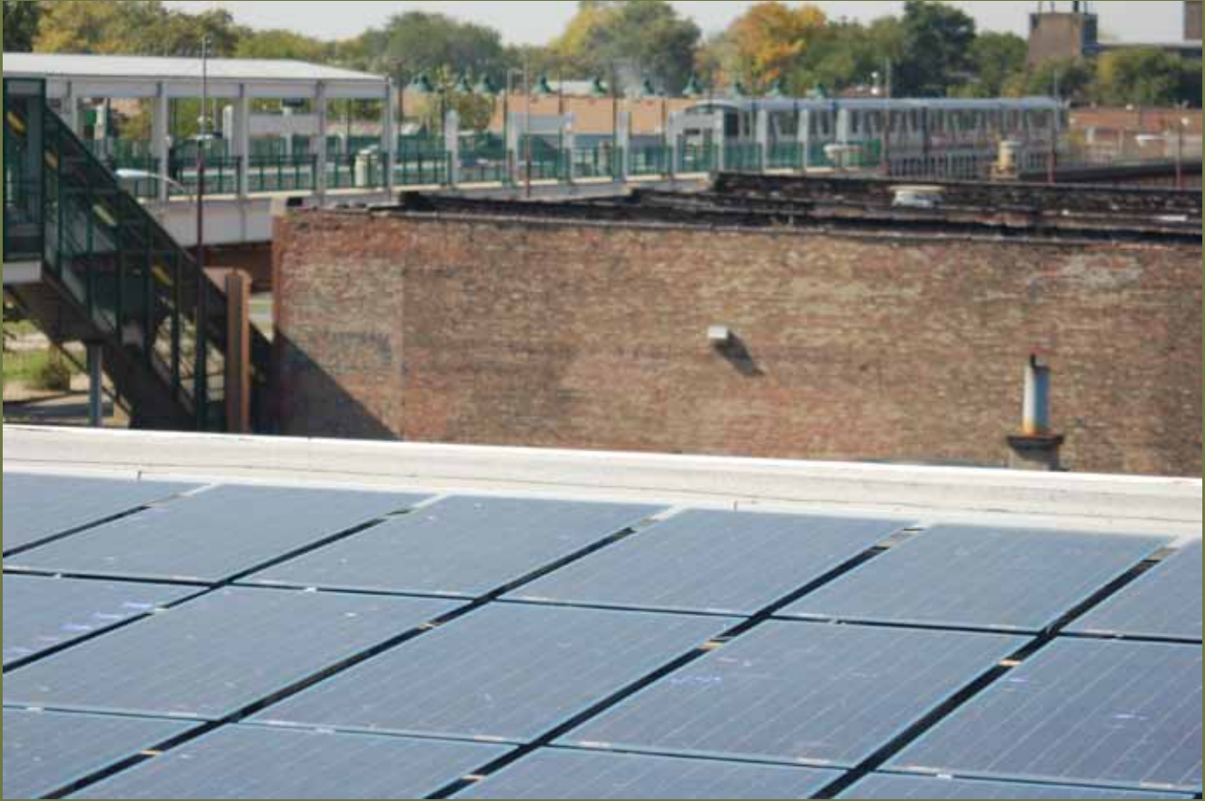
SOLAR PANELS ON THE ROOF OF BETHEL CENTER , A TRANSIT-ORIENTED DEVELOPMENT BUILT ON A REMEDIATE BROWNFIELD, CHICAGO, ILLINOIS