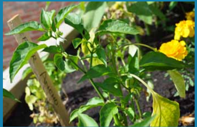
ANCHO PEPPERS GROWING IN A RAISED BED ON THE SITE OF A REMEDIATED BROWNFIELD, TORONTO