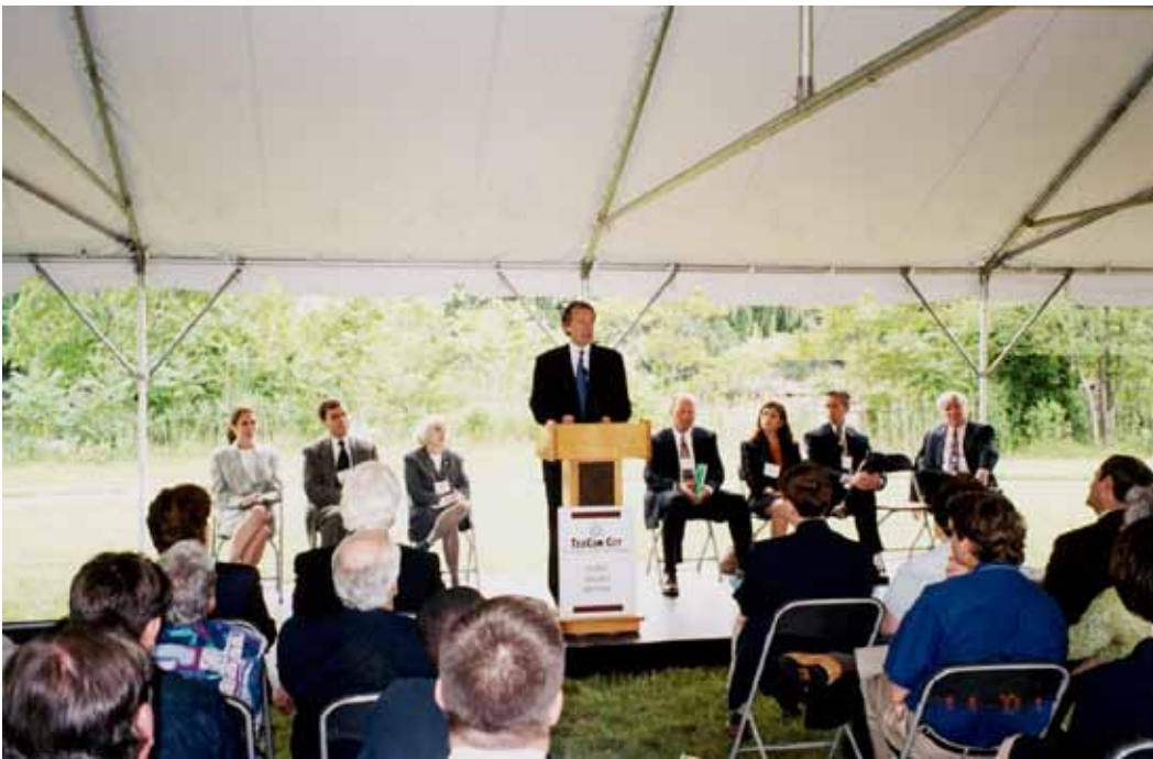
U.S. ENVIRONMENTAL PROTECTION AGENCY

In addition, grants for public works and economic development facilities from the Department of Commerce's Economic Development Administration and tax incentives from Congress help mitigate the brownfield redevelopment costs for local governments. Other programs that provide financial or technical assistance include the Department of Transportation's Livable Communities program, the Department of the Interior's National Park Service programs, and the U.S. Department of Agriculture, which provides Rural Development funds that can support brownfield assessment, cleanup, and community revitalization.