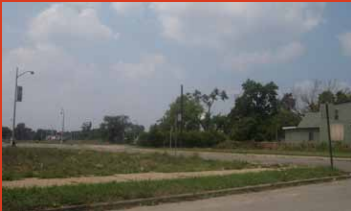
BROWNFIELD AT THE BASE OF THE AMBASSADOR BRIDGE THAT IS NOW HOME TO AN INTERNATIONAL WELCOME CENTER

During the EZ application process, the city developed a partnership with local businesses, the educational community, and nonprofits to determine ways to improve residents' quality of life through economic growth and revitalization of blighted neighborhoods, a criterion for EZ funding. This coalition determined that EZ funding would be an opportunity to create a brownfield remediation and redevelopment demonstration project in Southwest Detroit. To demonstrate their support for the proposed EZ initiatives, businesses, foundations, and banking institutions promised to match federal funds with $1.9 billion.