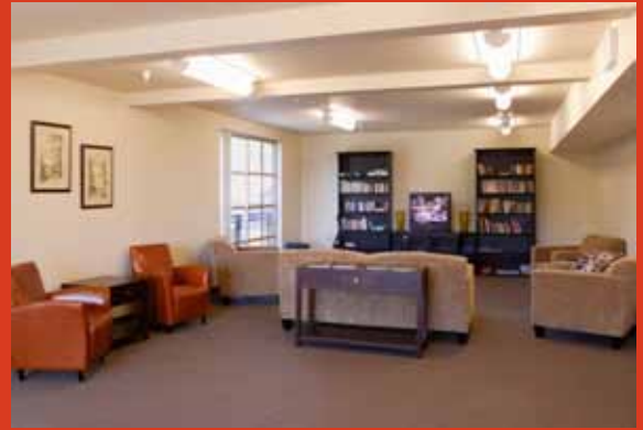
THE WATERSHED IS A GREEN, AFFORDABLE HOUSING DEVELOPMENT FOR SENIORS BUILT ON A REMEDIATED BROWNFIELD.

site would be perfect for a compact, affordable senior housing development, and CPAH subsequently purchased Bertha Triangle from ODOT.