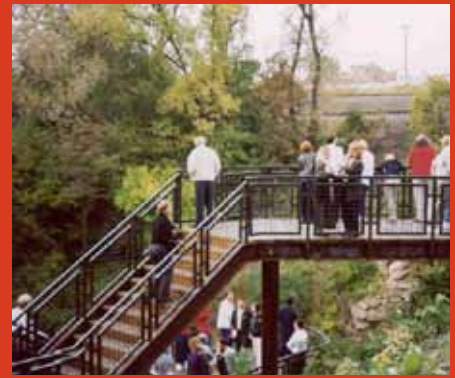
SLAVIC VILLAGE DEVELOPMENT