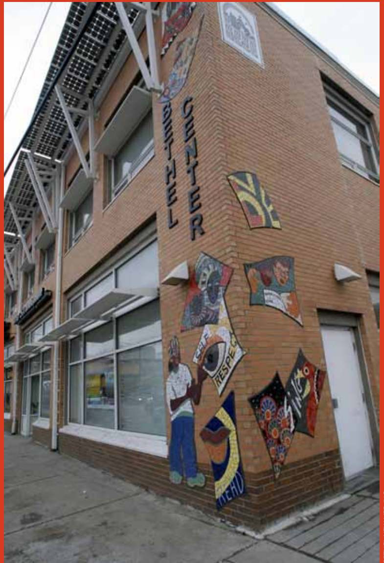
ARTWORK ON BETHEL CENTER'S FACADE ENLIVENES THE STREETScape

Today, Bethel Center serves as a building block for economic development in the low-income neighborhood in which it resides. The project began in 1995 when BNL and the community responded to a plan that called for decommissioning the Green Line Transit system. Partnering with FARR Associates, a local architecture firm, BNL helped develop a land-use plan focused on stabilizing the neighborhood. This plan is now known as the Lake Pulaski Transit Village Plan, and it calls for affordable, energy-efficient housing, multi-modal transportation improvements, commercial development, and brownfield redevelopment throughout the area. This final piece is noteworthy given that Bethel Center was constructed on a remediated brownfield site. The following case study tells the story of BNL's long struggle to find and secure funding for Bethel Center.