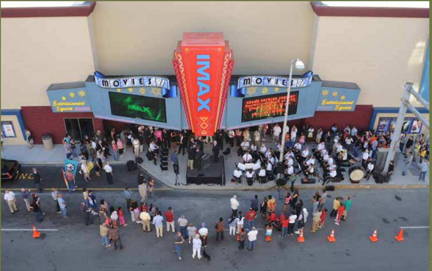
GRAND OPENING CELEBRATION OF A THEATER BUILT ON A FORMER PARKING LOT BROWNFIELD IN READING, PENNSYLVANIA