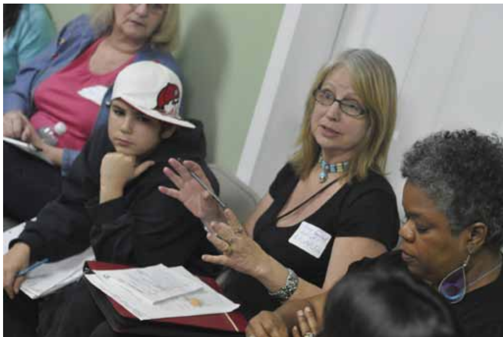
GRANDMOTHER AND GRANDSON PARTICIPATE IN A VISIONING DISCUSSION AT THE 2010 NATIONAL PLANNING CONFERENCE IN NEW ORLEANS

In the final step of the community visioning process, participants devise a set of strategies and develop an action plan that can serve as a blueprint for planning in the short and mid-term. This action plan will assist in achieving the vision statement outlined during the process.