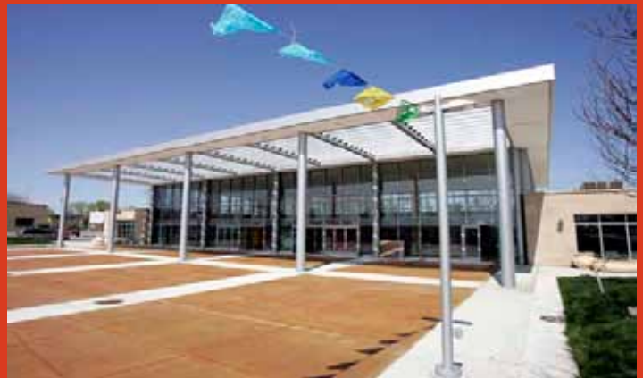
MEXICANTOWN INTERNATIONAL WELCOME CENTER AND MERCADO