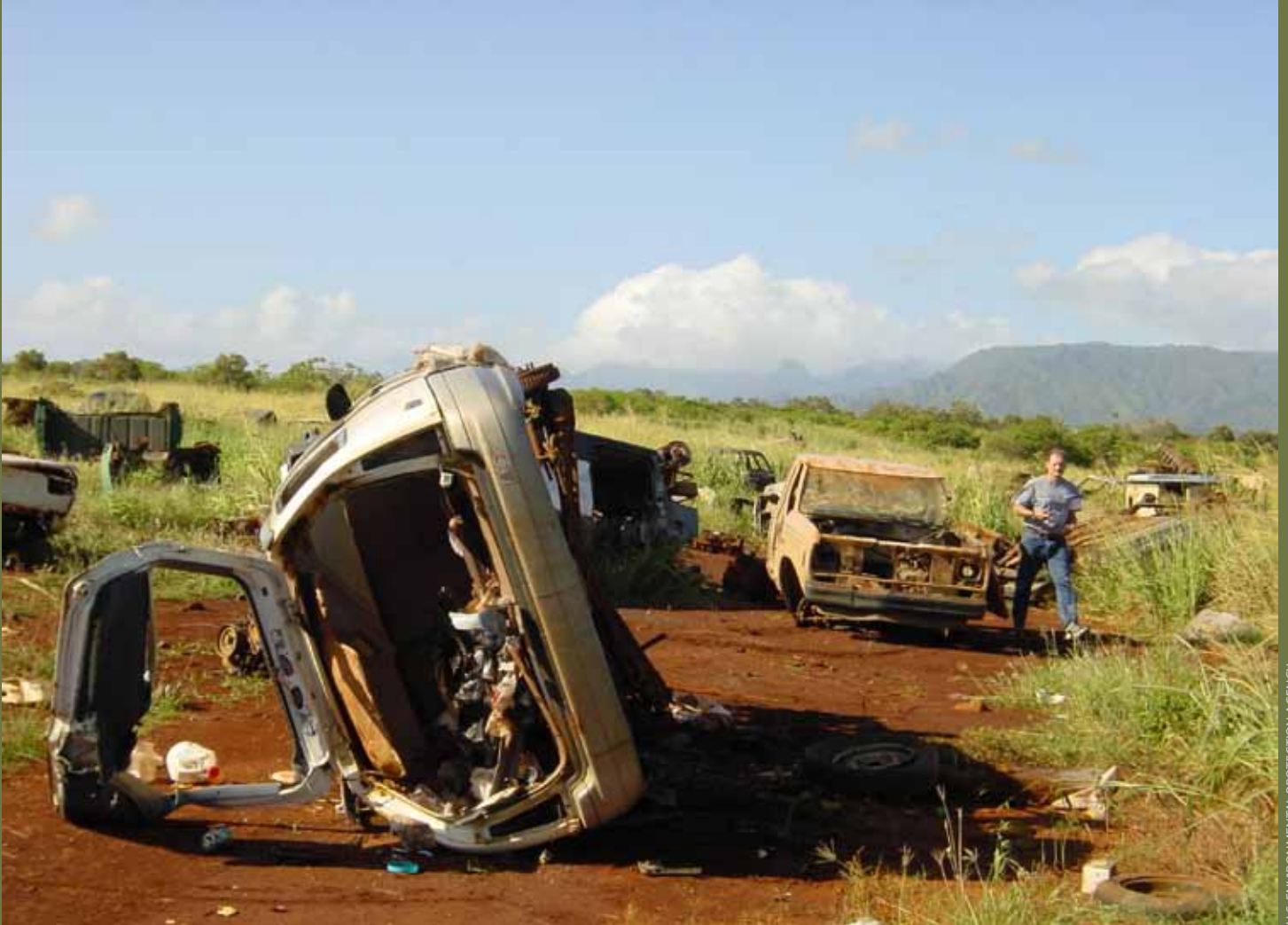
THIS COASTAL DUMPING GROUND IS NOW HOME TO A MULTIPURPOSE COMMUNITY CENTER IN LIHUE, KAUAI, HAWAII