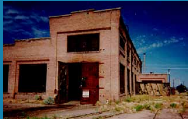
THE CITY OF EVANSTON, WYOMING RESTORED THIS FORMER UNION PACIFIC RAILROAD MACHINE SHOP IN 2004. ONCE A DERELICT BROWNFIELD SITE, THE BUILDING IS NOW A MULTIUSE PUBLIC FACILITY