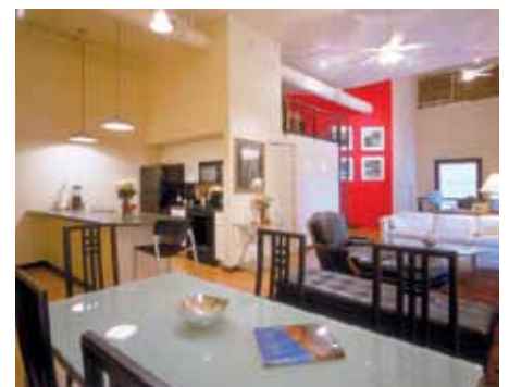
THE LOFTS AT ALBUQUERQUE HIGH SCHOOL IN NEW MEXICO