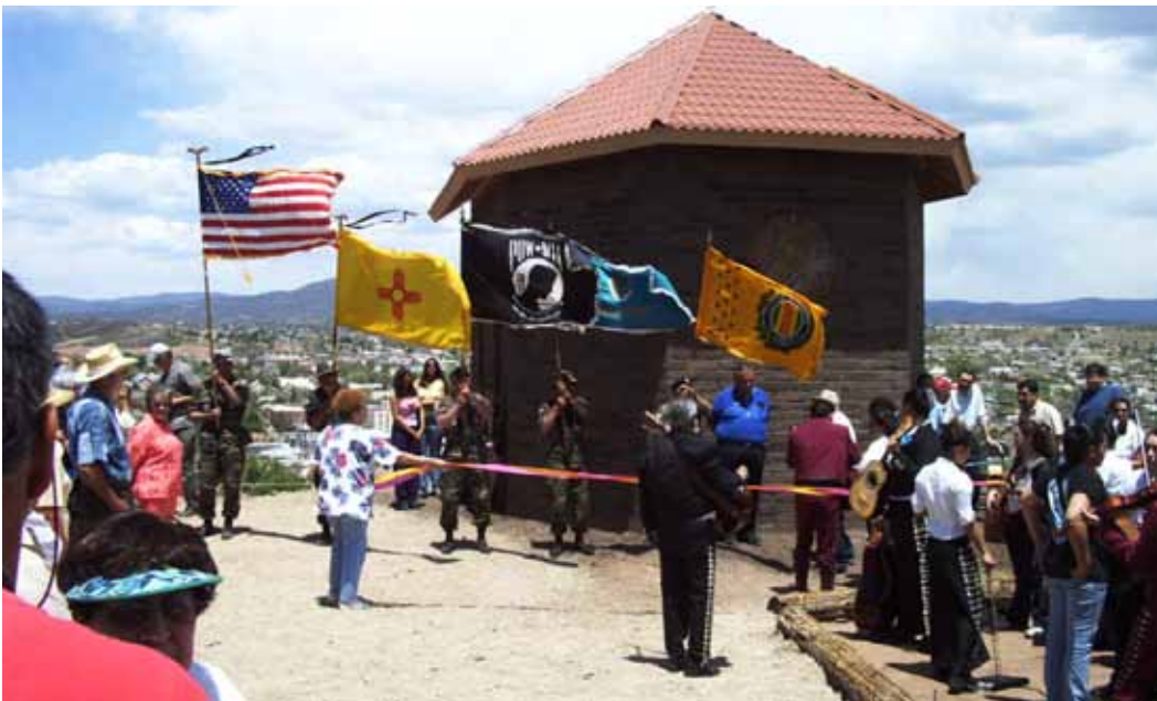
THE COMMUNITY CELEBRATES THE CONSTRUCTION OF LA CAPILLA CHAPEL REPLICA IN LA CAPILLA HERITAGE PARK IN SILVER CITY, NEW MEXICO