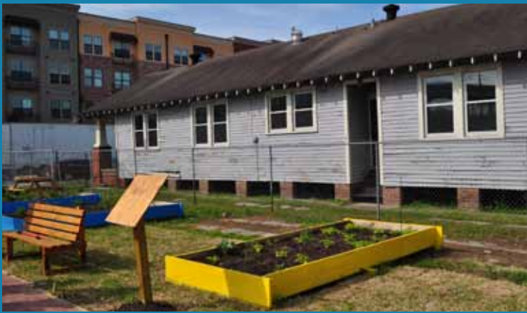
RAISED BEDS WHERE A DILAPIDATED HOUSE ONCE STOOD, NEW ORLEANS