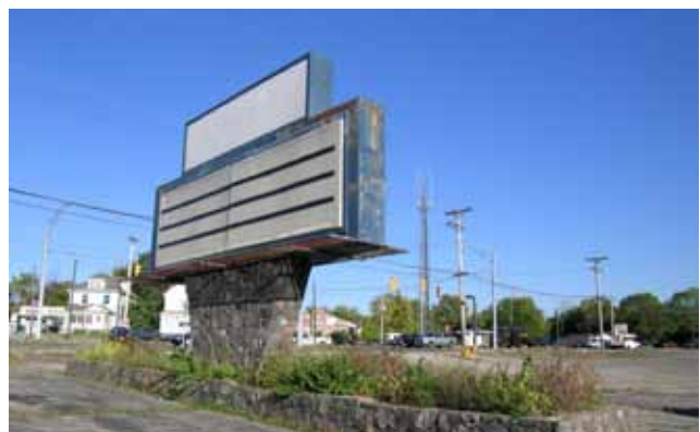
CLOSED STRIP MALL IN DAYTON, OHIO