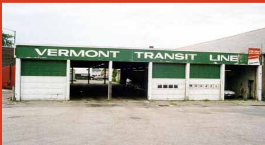
CHAMPLAIN HOUSING TRUST

With financial support, political will, and community involvement, CHT demolished the steel garage and constructed 12 new apartments and converted one historic barn on the property into nine apartments. CHT developed the second barn into four apartments and commercial uses, which include a laundromat and a garage that repairs donated cars and sells them at below-market rates to low-income buyers.