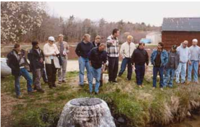
NEW DIRECTION JOB TRAINING PROGRAM IN NEW BEDFORD, MASSACHUSETTS

Naturally, cleanup and financing are major concerns for any person or organization considering taking on a brownfield redevelopment project. Banks are leery of investing in projects where contamination complicates the redevelopment process. Public funding often comes with strict timelines and bureaucratic processes that can be frustrating and confusing. However, liability protection can help ease the financial frustration by offering investors reasonable assurance that they will be clear of liability. (The three most commonly used liability protections are the no further action letter (NFA) , covenant not to sue , and a certification of completion (COC) . These are discussed in greater detail in Section 4.)