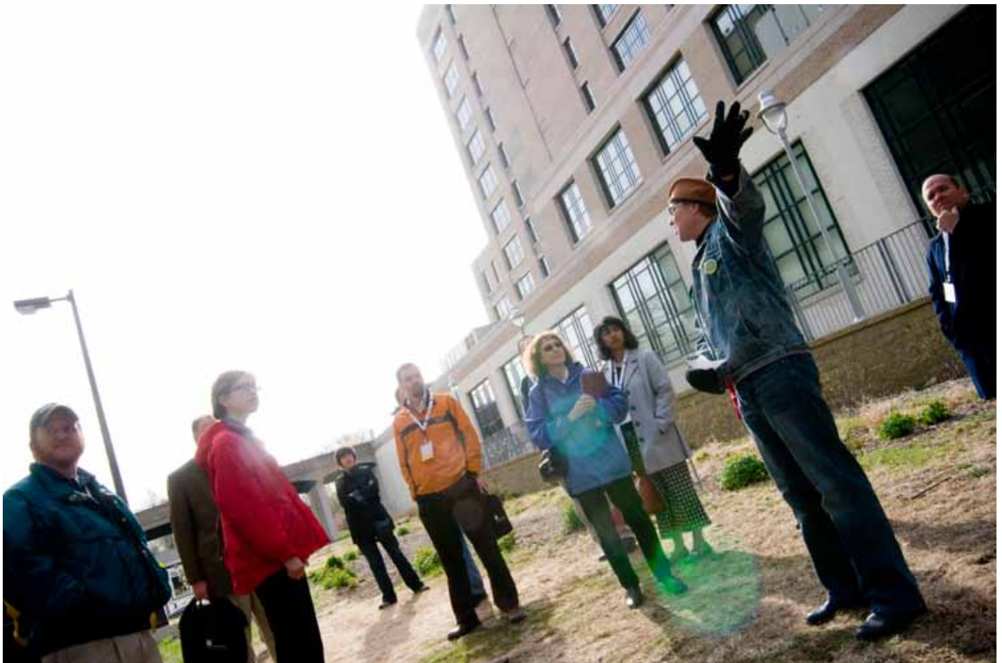
SITE TOUR OF THE COMMUNITY AS PART OF A CHARRETTE AT THE 2009 NATIONAL PLANNING CONFERENCE IN MINNEAPOLIS

CBOs can also try to influence state and federal brownfields policies so that more resources, such as site assessment, cleanup grants, and technical assistance, are made available. One way to do so is to lobby state and federal elected officials, letting them know how redevelopment efforts are constrained by current funding levels. Another avenue, particularly at the federal level, is to network with other organizations involved in the revitalization of brownfields, attend brownfield conferences and workshops to connect with allies, and contact national nonprofits that can amplify local-level concerns about brownfields in Washington, D.C.