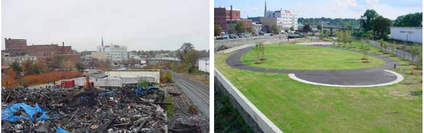
HOPE RUBBER PARKING LOT AND INDUSTRIAL WASTE SITE TRANSFORMED INTO A LUSH RIVERFRONT PARK IN FITCHBURG, MASSACHUSETTS

centers in the Northeast and Midwest, they often left behind obsolete and contaminated properties. While the U.S. transitioned from a manufacturing to a service-driven economy, the number of vacant, surplus properties multiplied. Compounding this situation was the concurrent trend toward off-shoring production, which meant many remaining U.S. manufacturers vacated existing production facilities in favor of new sites in other countries with lower wages or more favorable tax structures.