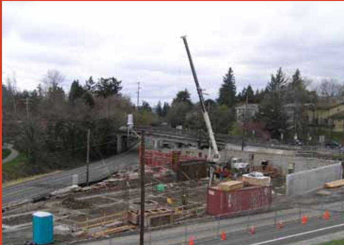
THE WATERSHED SITE UNDER CONSTRUCTION